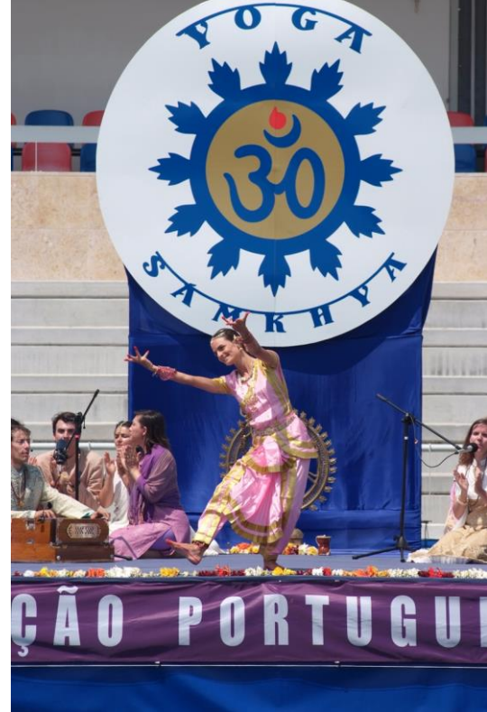
Traditional India Dance – Bhārata Nāthā Yama

The Yoga Master underlined that “Yoga allows us to achieve inner peace and therefore with manifestation on external acts, with respect for ecosystems and the sustainability so that we can pass on to future generations a planet better, not worse, than what we inherited” The program included melodic presentations of Kirtana by the Orchestra Choir – OMKĀRA, and fantastic advanced yoga demonstrations for adults, youngsters and children by PASHUPATI group.