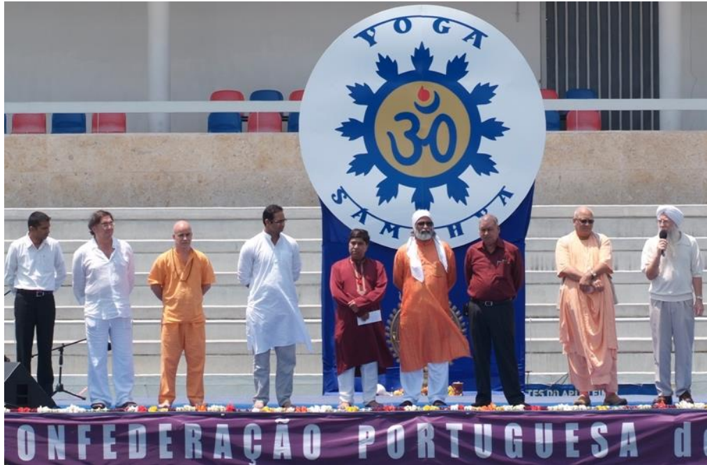
High Representatives of Yoga of Índia, United States, Italy, Spain

The Celebrations also emphasized the dedicated work of “ACAPO – Associação de Cegos e Amblíopes de Portugal” through the presence of a Yoga class for blind persons, and CARITAS Portugal.