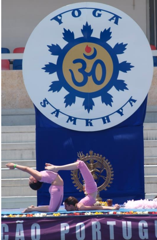
The Future and the Yoga for Children