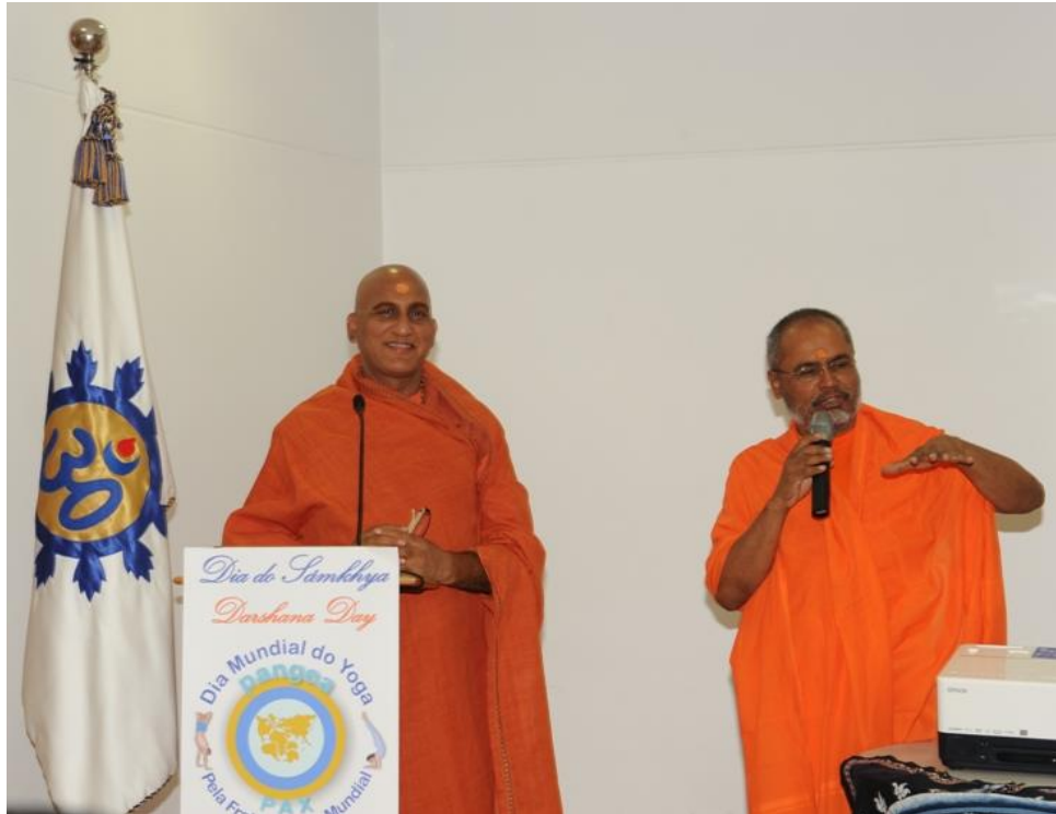
The Conferences of the Great Yoga Masters of India, Their Holinesses' the Svámin, bearers of the Wisdom of Traditional Yoga, filled us with Light.