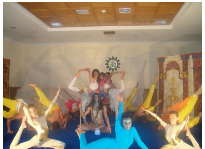
The dazzling performance of the PASHUPATI Group – the Elite of Advanced Yoga Demonstration – in the Hindu Traditional Tale of Adi Guru Shiva and Párvati on Mount Keilasha.