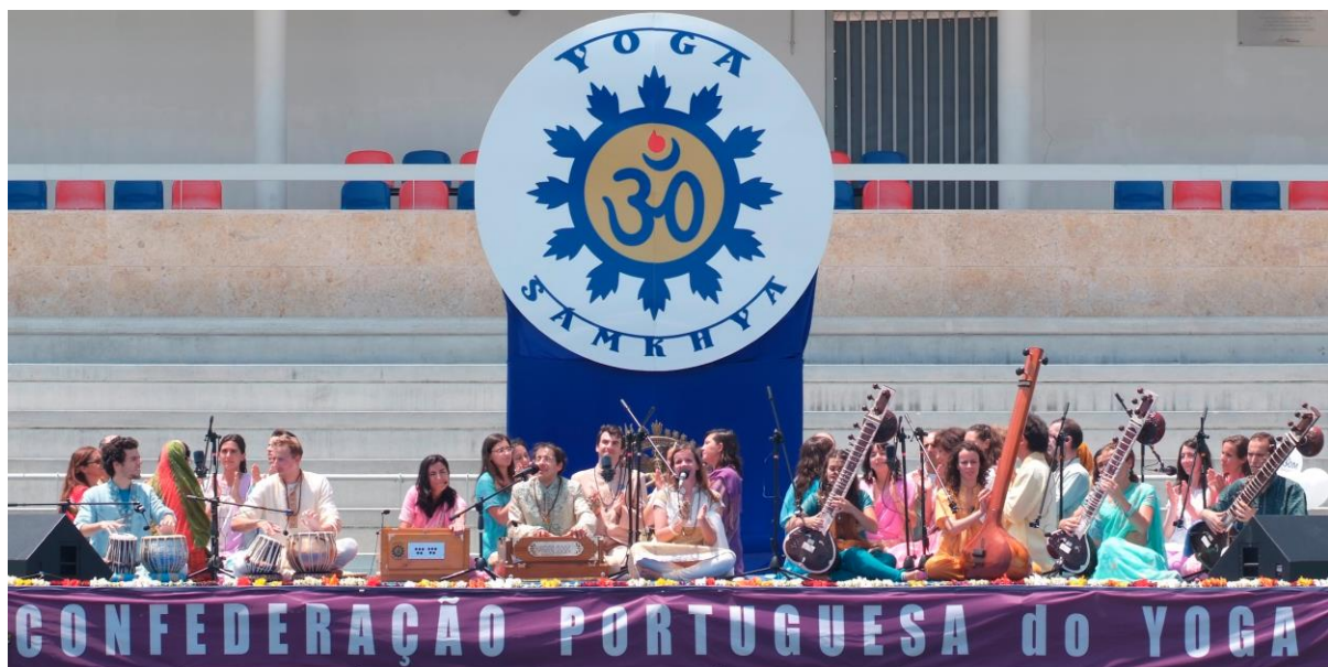
OMKÁRA – Choir and Orchestra of the Yoga Portuguese Confederation

After the Mega Class of Yoga, which gathered all practitioners of all ages, a vegetarian lunch was served and during the afternoon the attendees could also see a show of classical Indian dance – Bháráta Náthá Yama – followed by presentations of several Yoga Schools. No one was sorry to attend this event!