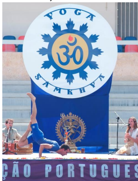
Pashupati Members incomparable in an Advanced Traditional Yoga Demonstration

“Every year,” the Master explained “this day bears an inspiring theme because Yoga as a set of very important principles as its foundation.” This year, the flag rose in the name of World Fraternity and “fair globalisation” because “without justice war will not stop, there will be no sustainable Peace, there will be peace in the heart of New Generations of areas on the planet who consider themselves wronged”