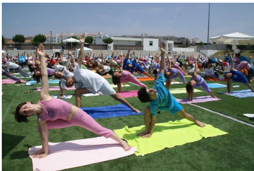
A Mega Yoga Class – Purusha Namaskāra

The Yoga Master underlined that “Yoga allows us to achieve inner peace and therefore with manifestation on external acts, with respect for ecosystems and the sustainability so that we can pass on to future generations a planet better, not worse, than what we inherited” The program included melodic presentations of Kirtana by the Orchestra Choir – OMKĀRA, and fantastic advanced yoga demonstrations for adults, youngsters and children by PASHUPATI group.