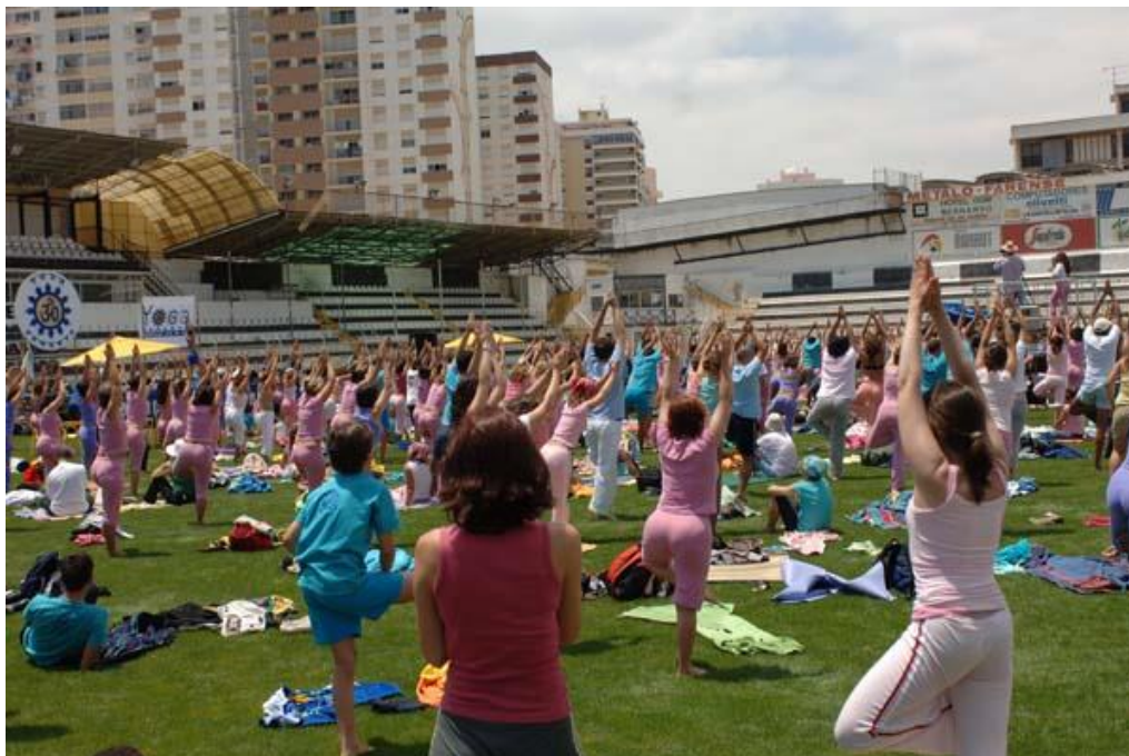
Over one thousand Yoga practitioners in "Estádio do Farense", 25th. June, 2006

DIA MUNDIAL do YOGA - Comemorado em 25 de Junho . Algarve . Faro Estádio S.Luis às 10 horas Informações: 289 813 136 e 217 802 810