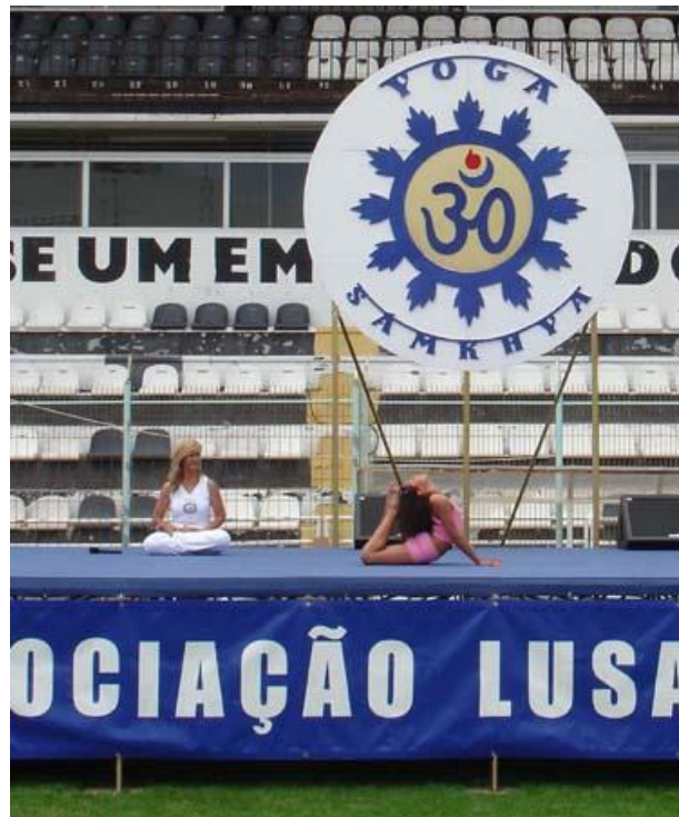
Sequence of Yoga for Children